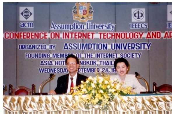
Figure 1. The Co-founders of Internet KSC

The Ministry of Commerce of Thailand approved the registration of Internet KSC or Internet Knowledge Service Center Co., Ltd. on June 7, 1994 with the purposes of providing telecommunications services including Internet. Thus, Internet KSC is the first Provider of Internet Services legally registered in Thailand. All the other fifteen ISPs in Thailand were registered in Thailand months or years after Internet KSC.