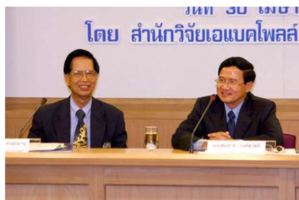
Figure 5. H.E. Somchai Wongsavat, Permanent Secretary of Justice (Later Prime Minister) with Prof. Srisakdi, Chairman of ABAC POLL.