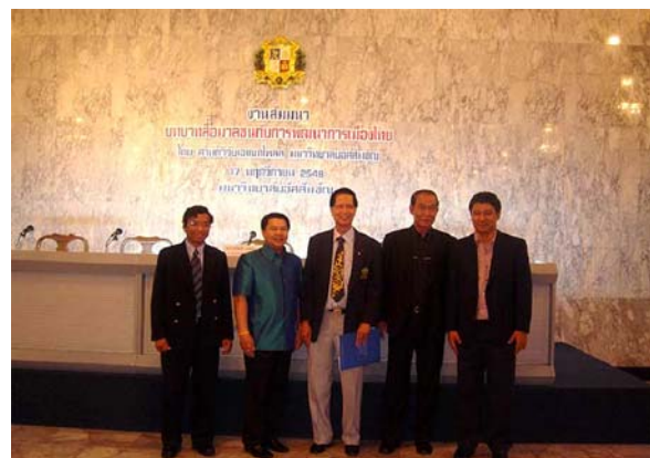
Figure 4. ABAC Poll Seminar on “Roles of Mass Communication in Development of Political Affairs”, 17 November 2005.