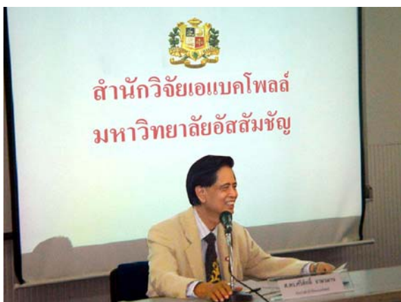
Figure 2. ABAC Poll Seminar on “Dangers to Female”, 10 November 2005.

Sample photographs of ABAC Poll activities are shown in Figures 1-7.