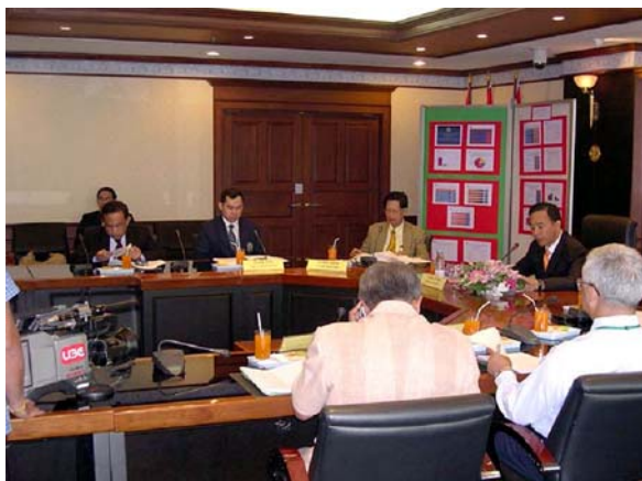
Figure 1. ABAC Poll Seminar on “Drugs Suppression Activities”, 25 July 2005.