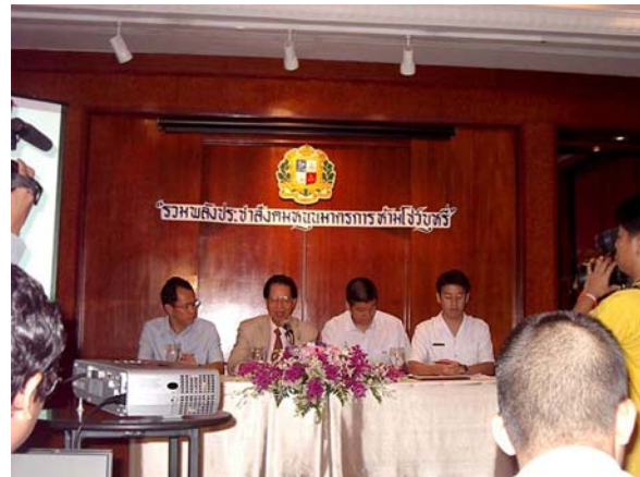
Figure 3. ABAC Poll Seminar on “Measures Against Smoking”, 11 November 2005.

Sample photographs of ABAC Poll activities are shown in Figures 1-7.