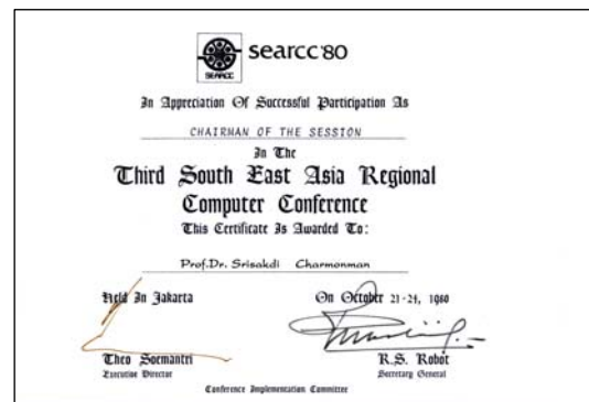
Figure 7. Chairman of the Session at SEARCC.