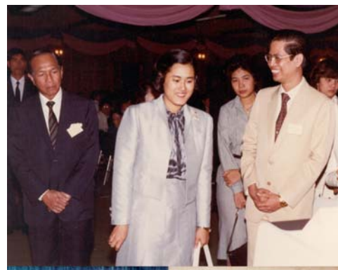
Figure 4. HRH Princess Maha Chakri Sirindhorn Graciously Opened the Seminar on Computer in Rattanakosin Era.

at the Nation Research Council of Thailand as shown in Figure 4 on 20 December 1982; Evolution and Control of Computer at Bangkok Bank on 10 January 1983; the Third Wave or IT Wave at AUA on 20 January 1983; Computer for Director Generals of the Ministry of Science on 14 February 1983; Computer for Top Executives in Pataya on 12-13 March 1983; Computers for Teachers at Triem Udom School on 22 March 1983; Computers for Police Officers on 8 April 1983; Computers for Top Executives of the Ministry of Justice on 14 April 1983; Computers for Department Managers at Bangkok Bank on 30 April 1983; Computers for Librarians in Singapore on 30 May 1983; Computers for Top Executives of the Ministry of Industries on 7 June 1983; Computer for Top Executives of the Ministry of Finance on 9 June 1983, and etc.