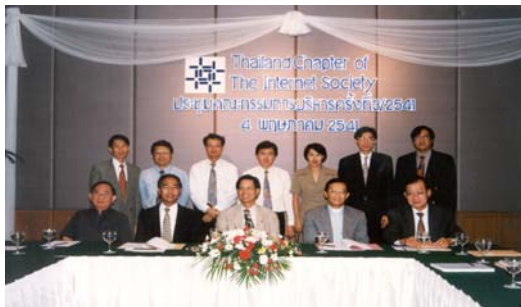
Figure 5. Executive of Thailand Chapter of ISOC.