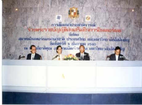
Figure 10. Open Hearing on Internet Promotion Act.

ACM and Thailand Chapter of the IEEE to provide venue and secretarial supports to continue the law drafting activities. Several open hearings were held such as one shown in Figure 10.