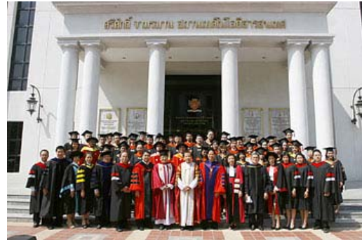
Figure 11. Awardees of SC Prizes in 2008.

graduate of Assumption University as shown in Figure 11.