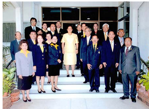
Figure 12. HRH Princess Maha Chakri Sirindhorn Graciously Granted Permission for a Group Photo.

The Interdisciplinary Network of the Royal Institute of Thailand (INRIT) under the Royal Patronage of HRH Princess Maha Chakri Sirindhorn, with officers as shown in Figure 12.